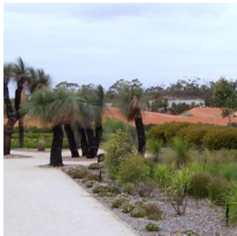
The mystery coach trip on 11 November was a visit to the Royal Botanical Australian Garden at Cranbourne – a stunning destination for the last outing of the year.

Sadly the Fashion Show planned for October this year had to be postponed due to maintenance work at The Little Shop. However, we hope to re-instate it in 2012. Your Events Committee is already swinging into action for 2012. Seats for Yes Minister in February have already been advertised and now a group booking for Annie is in the pipeline, while trips to city and country destinations are under consideration.