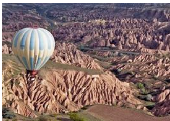
Hot air ballooning over Cappadocia.