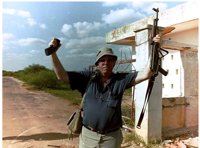
Covering the civil war in Somalia in 1992, Bill celebrates the return of his Somali bodyguard's AK-47 rifle after it was confiscated by US Marines during the US military intervention.

I've also become quite busy writing for the Harvard University Nieman Foundation's Policy Watchdog project, which advises young journalists on questions to pose to prevaricating politicians when they blow smoke around important domestic and foreign policy issues. ( www.niemanwatchdog.org ). And I try to take the same approach during the various U3A courses I conduct.